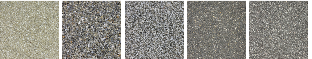
Winter Quartz 1-3mm Guyanan Bauxite Footgrade, 1-3mm Silver Grey Granite 1-3mm, Ocean Grey 1-3mm Silver Blue Granite 1-3mm