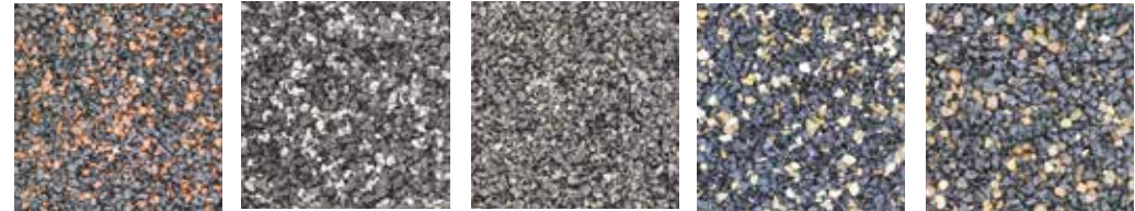
Red Noir 50 Silver Noir 50 Green Noir 50 Buff Noir 50 Tan Noir 50