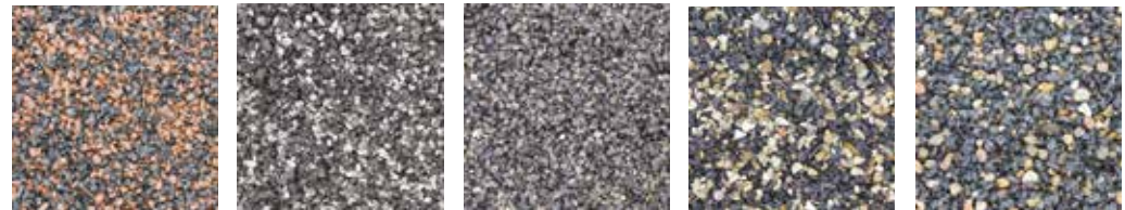
Red Noir 75 Silver Noir 75 Green Noir 75 Buff Noir 75 Tan Noir 75